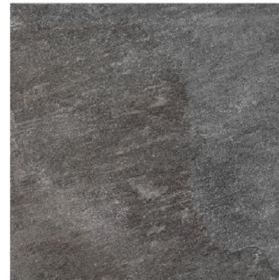
■ RAS608 - NATURAL SURFACE ■ RAS608G - GRIP SURFACE ■ 60x60 X 8 RANDOMNESS