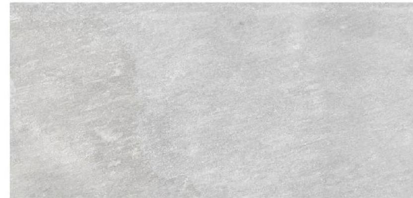
■ RAS1201 ■ 60x120 X 4 RANDOMNESS