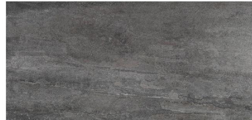
■ RAS1208 ■ 60x120 X 4 RANDOMNESS