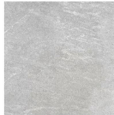
■ RAS601 - NATURAL SURFACE ■ RAS601G - GRIP SURFACE ■ 60x60 X 8 RANDOMNESS