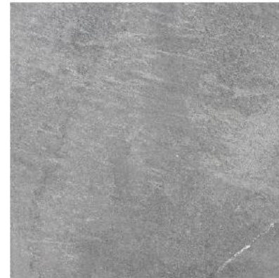
■ RAS603 - NATURAL SURFACE ■ RAS603G - GRIP SURFACE ■ 60x60 X 8 RANDOMNESS