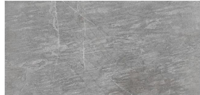
■ RAS1203 ■ 60x120 X 4 RANDOMNESS